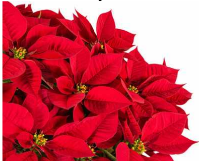
Poinsettia: The Flower of Christmas

WELCOME TO CENTRAL UNITED METHODIST CHURCH 4373 Galley Road, Colorado Springs, CO 80915-2728 Telephone: (719) 597-6642 Fax: (719) 597-7614